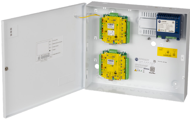
2ACCESS-12 (boards not included)