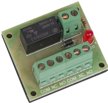
Mini Switching Relay