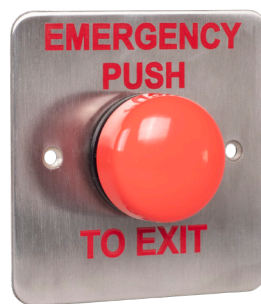
Alternative Plate / Options Available