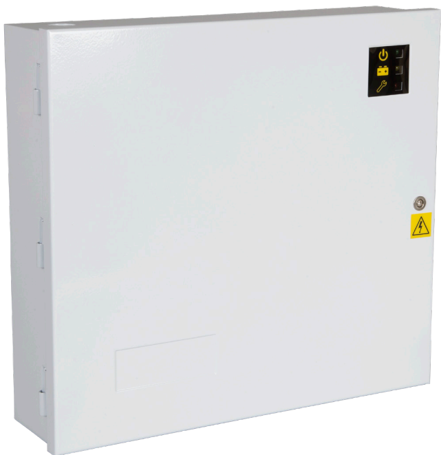
24V POWER SUPPLY

Market leading Power Supplies just got better, now with replaceable modular boards. Allowing you to upgrade your products both quickly and easily